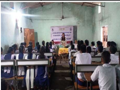
Awareness campaign on POCSO Act by DLSA Jharsuguda.