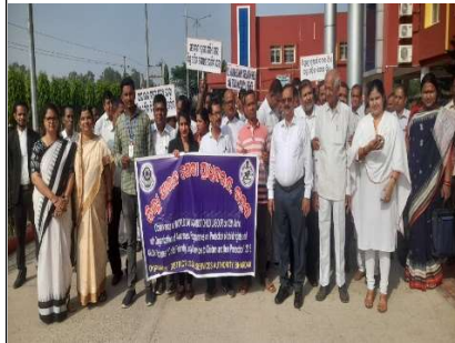
Observation of World day against Child Labour by DLSA Bhadrak.