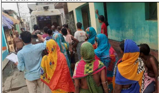
Jail visit Awareness campaign