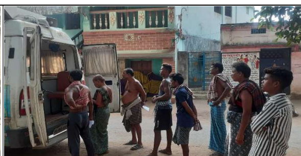
Mobile van Awareness