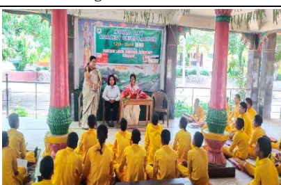
Awareness Campaign on a day against child labour by DLSA Nuapada.