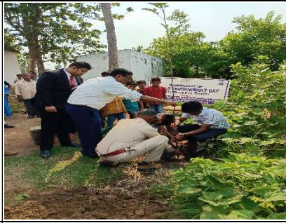
Observation of World Environment Day by DLSA Gajapati.