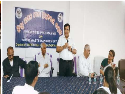
Awareness campaign on Solid waste management by DLSA Bhadrak.