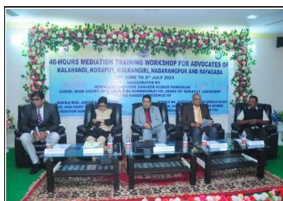
Inaugural ceremony of Mediation training Programme at Koraput