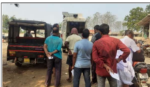
Mobile Van Awareness