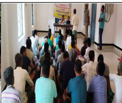
Awareness campaign for jail inmates by DLSA Nuapada