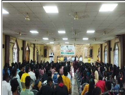
Observation of World Environment day by DLSA Bhadrak.