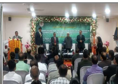
Valedictory ceremony of Mediation training Programme at Koraput