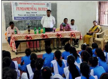
Awareness Campaign on Fundamental duties by TLSC Bissamcuttack