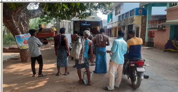
Jail visit Awareness campaign