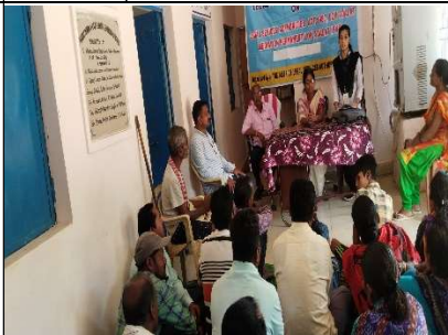
Awareness campaign on legal services Authorities act, 1987.