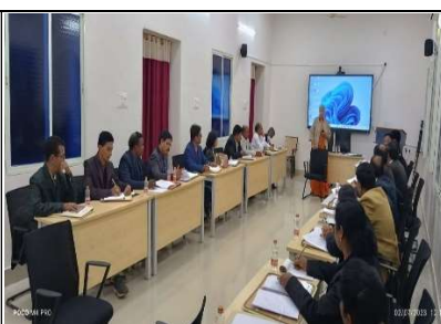
Training session of Advocates by trained Mediator at Koraput.