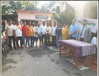
Observation of World Environment Day by TLSC Bissam Cuttack.