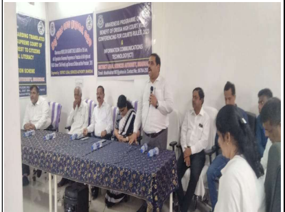
Observation of World day against Child Labour by DLSA Bhadrak.