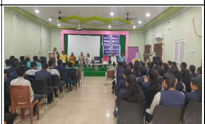
Awareness camp on POCSO Act by DLSA Rayagada.