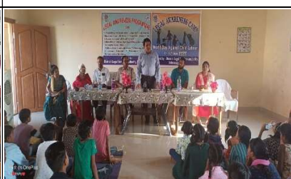
Observation of World day against Child Labour by DLSA Nabarangpur.