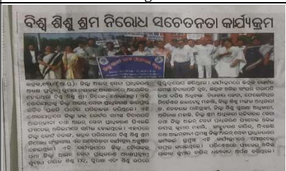
News clippings of Awareness Campaign on Day against Child labour.