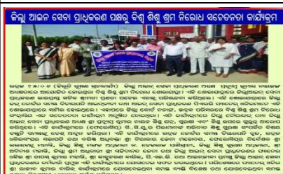
News clippings of Awareness Campaign on Day against Child labour.