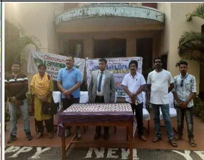
Observation of World Environment Day by TLSC Bissam Cuttack.