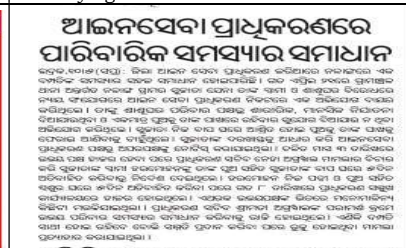
News clippings of successful Mediation in a Domestic Violence matter.