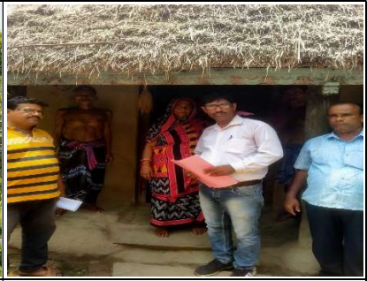
Awareness camp on with Door to Door Visit by DLSA Bhadrak.