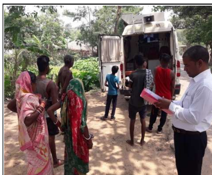
OSLSA Mobile Van Awareness Campaign by DLSA Bhadrak.