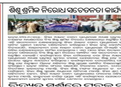
News clippings of Awareness Campaign on Day against Child labour.