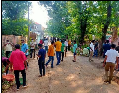
Observation of World Environment Day by TLSC Bissam Cuttack.