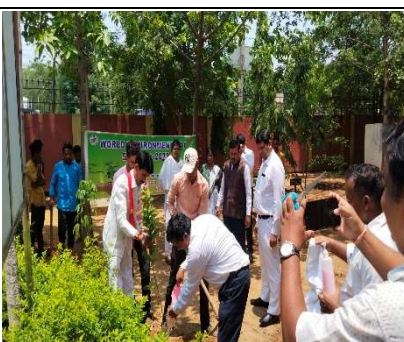
Observance of World Environment Day by DLSA Nuapada.