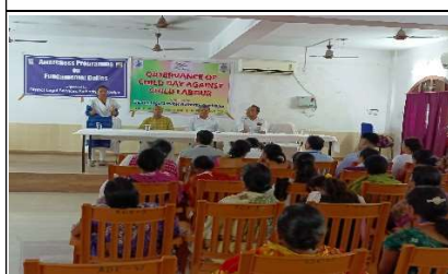
Observation of World day against Child Labour by DLSA Sambalpur.