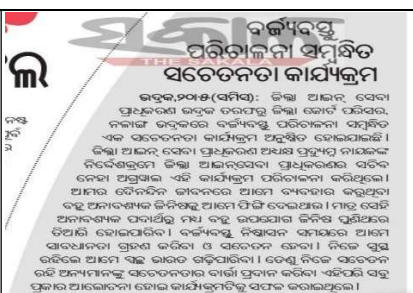
News clippings of Awareness Campaign on Solid Waste management