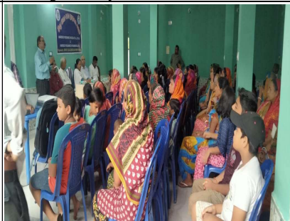
Awareness camp on POCSO Act by DLSA Bhadrak.