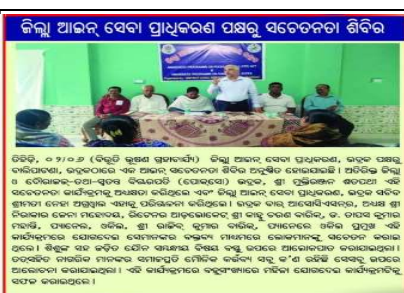
News clippings of Awareness Campaign on POCSO Act.