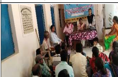
OSLSA Mobile Van Awareness Campaign at Sundargarh District