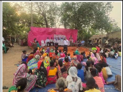
Observation of World day against Child Labour by TLSC Talcher.