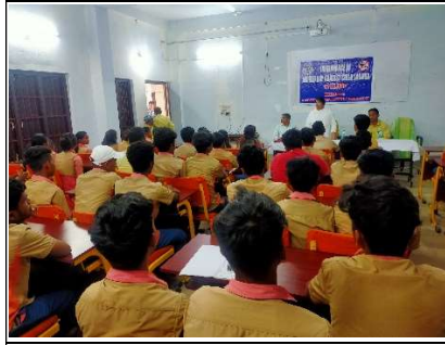
Awareness camp on World Day against Child Labour by TLSC Bissamcuttack.