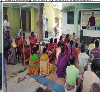
Awareness camp on SC & ST Prevention Atrocity Act by DLSA Sambalpur.