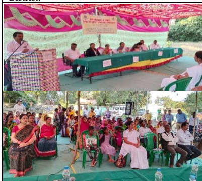
Legal Awareness Programme in collaboration with NCW by TLSC Bheden of Bargarh District.