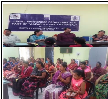
Awareness camp on Epidemic Act by DLSA Sambalpur.