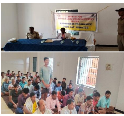
Legal Awareness camp in Jail by DLSA Nuapada