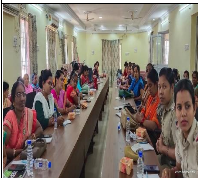
Legal Awareness Programme in collaboration with NCW by TLSC Banpur of Khurda District.