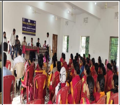
Legal Awareness Programme in collaboration with NCW by TLSC Chandahandi of Nabarangpur District.