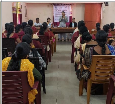
Legal Awareness Programme in collaboration with NCW by TLSC Rajgangpur of Sundargarh District.