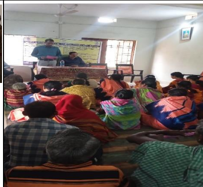
Awareness camp on Establishment & functioning of PLA by DLSA Sambalpur.