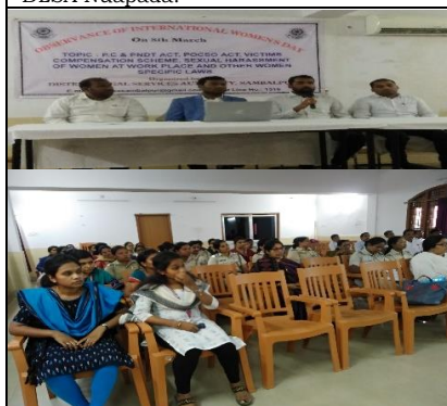
Observation of Women's Day by DLSA Sambalpur.