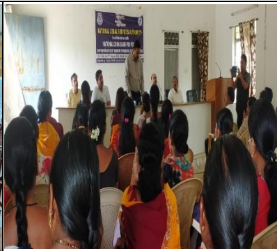
Legal Awareness Programme in collaboration with NCW by TLSC Umarkote of Nabarangpur District.