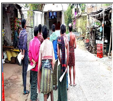
Mobile Van Awareness Campaign at Nayagarh District.