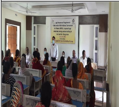
Legal Awareness Programme in collaboration with NCW by TLSC Kujanga of Jagatsinghpur District.