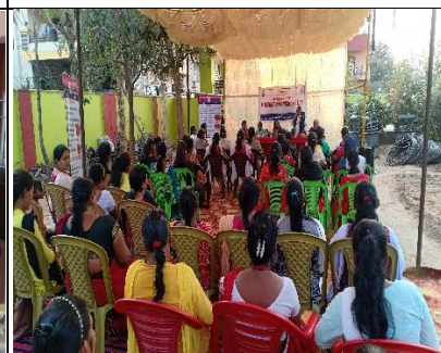
Observation of International Women's Day by DLSA Jharsuguda.