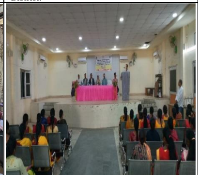
Legal Awareness Programme in collaboration with NCW by TLSC Kuchinda of Sambalpur District.