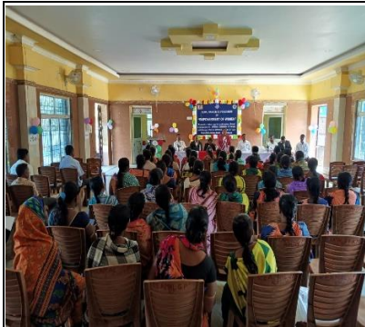
Legal Awareness Programme in collaboration with NCW by TLSC Reamal of Deogh District.