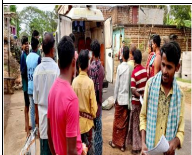
Mobile Van Awareness Campaign at Rayatodasara Village under TLSC Daspalla.