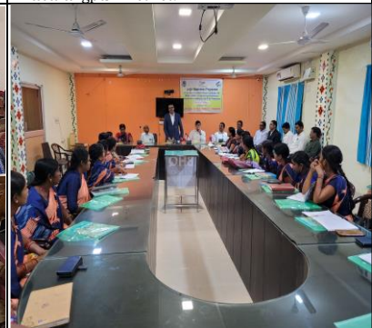
Legal Awareness Programme in collaboration with NCW by TLSC Rairakhol of Sambalpur District.