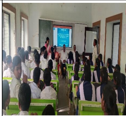
Awareness camp on Motor vehicle Act by DLSA Nuapada