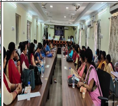
Legal Awareness Programme in collaboration with NCW by TLSC Banpur of Khurda District