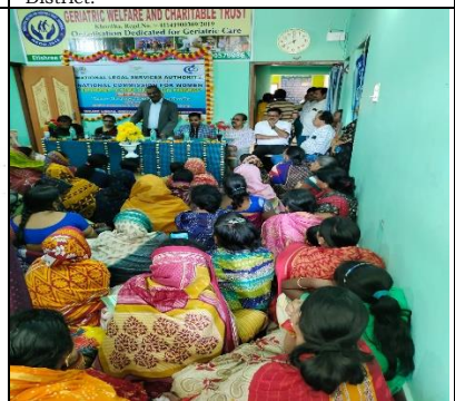
Legal Awareness Programme in collaboration with NCW by TLSC Khurda of Khurda District.