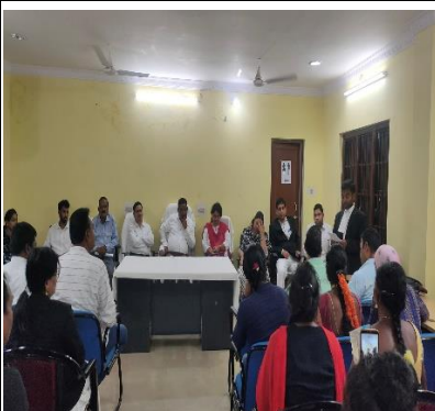
Legal Awareness camp on legal & Social entitlements of Third gender by DLSA Rayagada