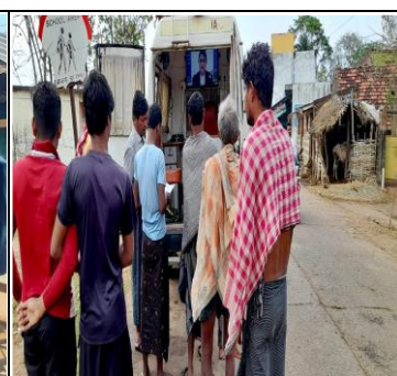
Mobile Van Awareness Campaign at Baghuapali Village under TLSC Bhapur.