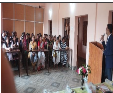
Observation of International Women's Day by DLSA Nayagarh.