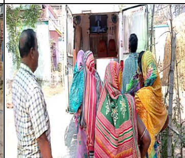
Mobile Van Awareness Campaign at Marthapada village under TLSC Ranpur.