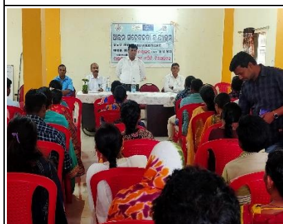
Awareness camp on SC & ST Prevention Atrocity Act by TLSC Bissamcuttack