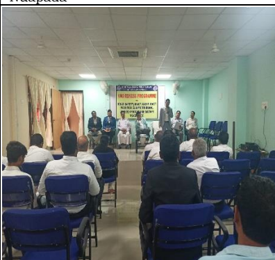
Awareness camp on Motor vehicle Act by DLSA Gajapati.