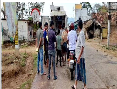
Mobile Van Awareness Campaign at Kunjabihariapur village under TLSC Khandapara