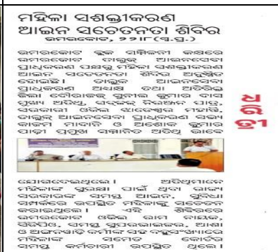
Newspaper clippings of Legal Awareness Programme in collaboration with NCW.