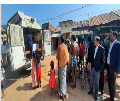
Mobile Van Awareness Campaign at Ganjam district