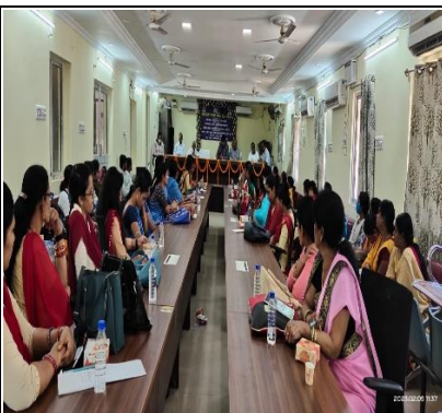
Legal Awareness camp in collaboration with NCW by TLSC Banpur Under DLSA Khurda.