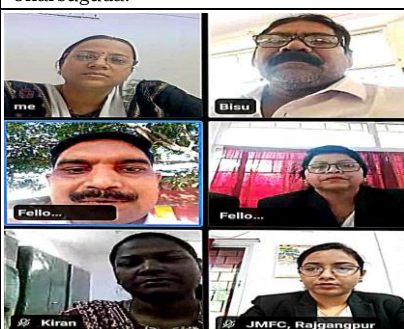
Virtual Awareness camp on Epidemic Act and Govt. guidelines by TLSC Rajgangpur.