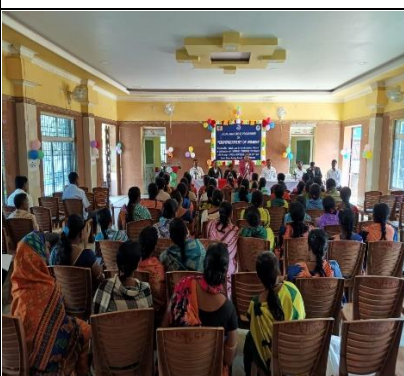
Legal Awareness camp in collaboration with NCW by TLSC Reamal Under DLSA Deogarh.