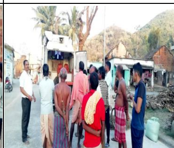
Mobile Van Awareness Campaign at Marthapada village under TLSC Ranpur.