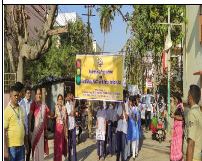
Awareness rally on Road safety MACT and Motor vehicle Act by DLSA Cuttack.