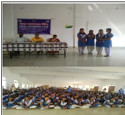
Awareness camp on POC SO Act by DLSA Sambalpur.