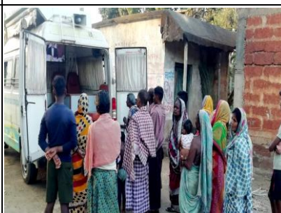
Mobile Van Awareness Campaign at Kunjabiharipur village under TLSC Khandapara