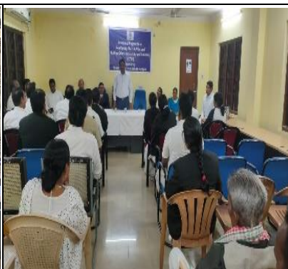
Awareness camp on Motor vehicle Act by DLSA Rayagada.