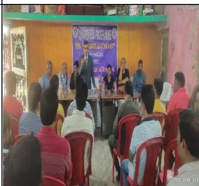
Awareness camp on Motor vehicle Act by TLSC Talcher.