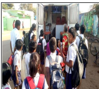
Mobile Van Awareness Campaign at Nayagarh District.