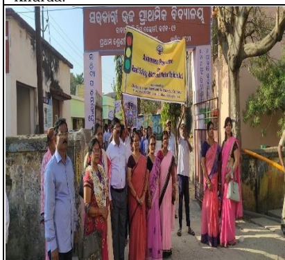
Awareness camp on Road safety MACT and Motor vehicle Act by DLSA Cuttack.