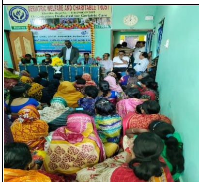
Legal Awareness camp in collaboration with NCW by TLSC Khorda Under DLSA Khurda.