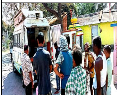
Mobile Van Awareness Campaign at Rayatodasara Village under TLSC Daspalla.