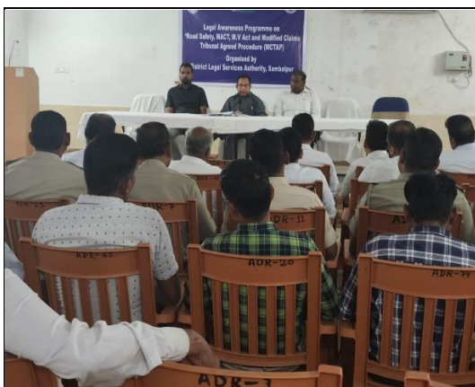
Awareness camp on Road safety MACT and M.V.Act and modified claimed Tribunal by DLSA Sambalpur.