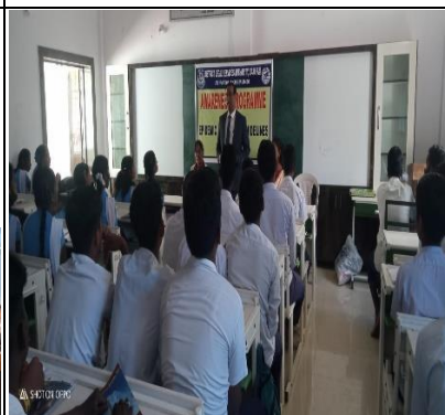
Awareness camp on Epidemic Act and Govt. guidelines by DLSA Gajapati.