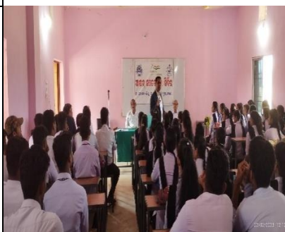
Awareness camp on Epidemic Act and Govt. guidelines by DLSA Nayagarh.