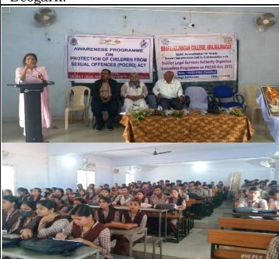
Awareness camp on Protection of Children from Sexual Offence by DLSA Jharsuguda.