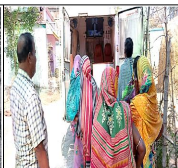
Mobile Van Awareness Campaign at Baghuapali Village under TLSC Bhapur.