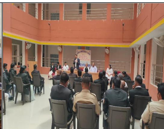
Awareness camp on Road safety MACT and M.V.Act and modified claimed Tribunal by DLSA Nabarangpur.