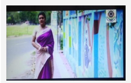
Domestic Violence act