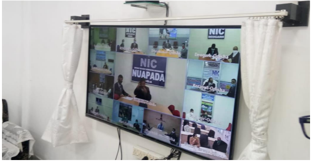
Glimpses of State Level Round Table on status of Implementation of PWDV Act in Odishaby Member Secretary OSLSA 19th September 2020.