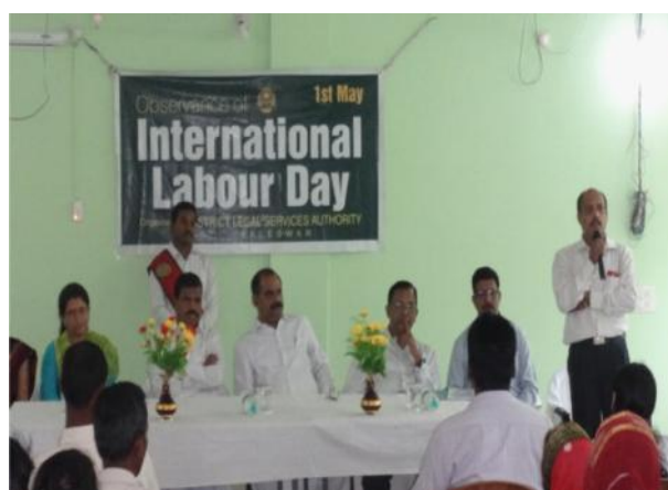
Observance of International Labour Day at Balasore on 01.05.2017