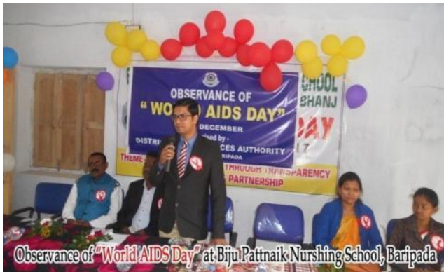
Observance of "World AIDS Day" at Biju Pattnaik Nursing School, Baripada

A Sensitization / Awareness Programme for Un- organized Sector Labour under the Scheme NALSA (Legal Services to Un- organized Sector Labour) was organized by the DLSA. Further 7 nos. of special Awareness Programmes were also organized by the DLSA on different dates.