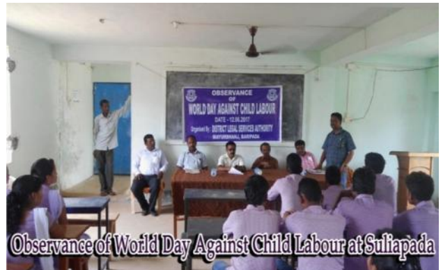
Observance of World Day Against Child Labour at Suliapada