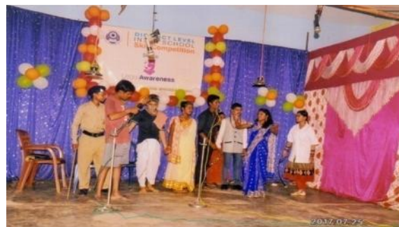
Skit competition organised by the DLSA on 25.7.2017