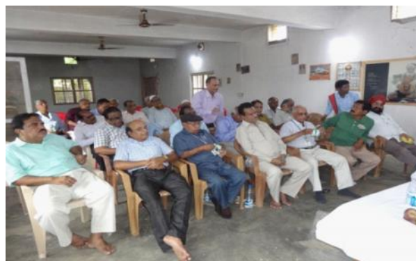
Observance of Senior Citizen and World Mental Health Day