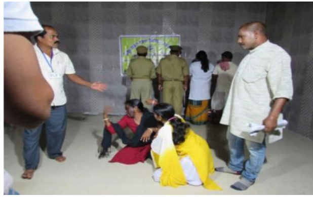
Street play on NALSA Scheme