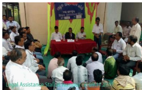
Legal Awareness Camp Legal Awareness Camp