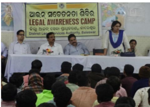
Awareness programme at District Jail, Balasore on 15.11.2017