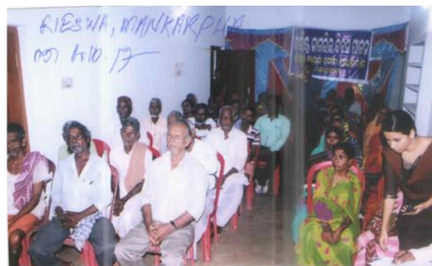
Legal Awareness Camp Legal Awareness Camp