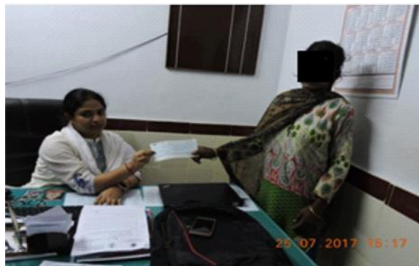
Cheques are being handed over to the victims by the Secretary, DLSA, Cuttack