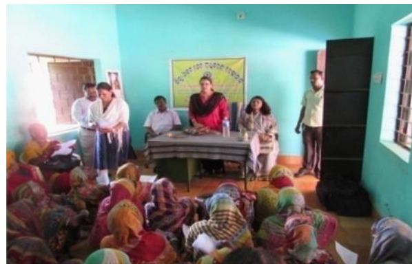
Awareness Programmes on NALSA(Legal services to victims of Acid attacks) and Odisha Victim Compensation Scheme, and a Rally.