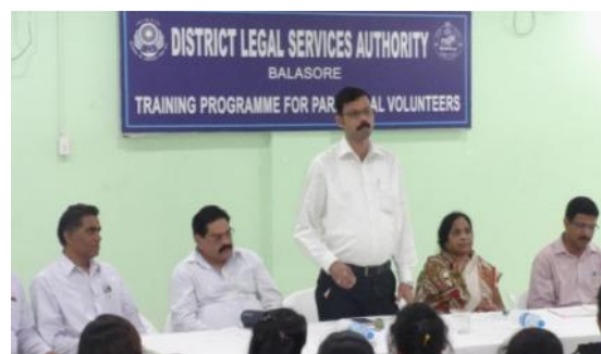
Para Legal Volunteers training programme at the conference hall of DLSA, Balasore on 05.08.2017