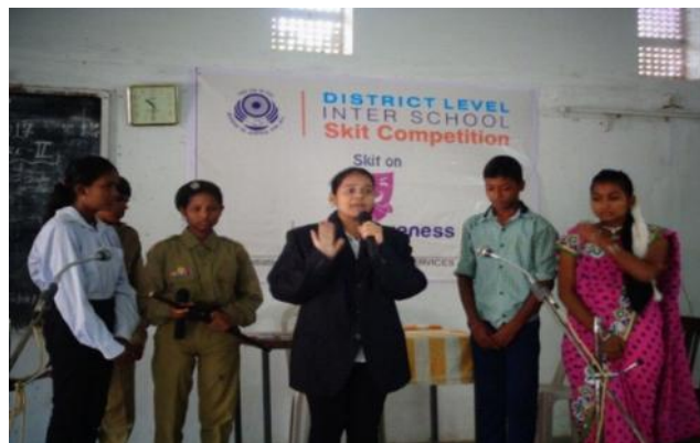
Skit competition staged by students