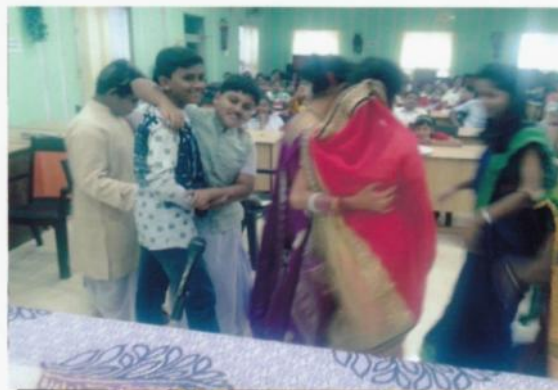
DIST. LEVEL SKIT COMPETITION, DLSA, JAJPUR DRDA CONFERENCE HALL, DT-05.07.2017