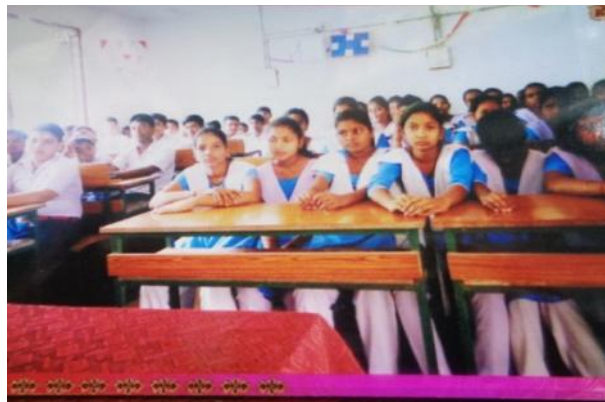
Legal literacy class for members of SLIC

Skit competition was organised by the DLSA on 16.7.2017 involving the Members of Student Legal Literacy Clubs. Further, 40 Legal Literacy Classes have also been taken in the 10 no.of Student Legal Literacy Clubs.