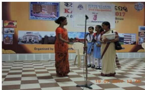
Legal Literacy class conducted in Ravenshaw Collegiate School and Skit Competition being staged on 19.7.2017 by the Members of the Student Legal Literacy Clubs.