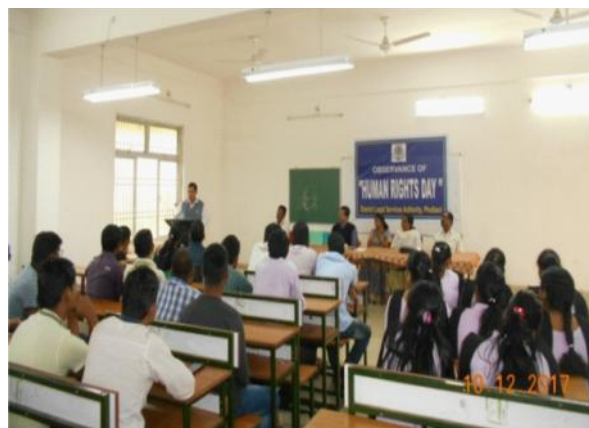
Seminar on topic “Human Rights: the Role of Students”