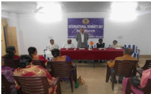
Observance of International Women's Day on 8.3.2017 in the District Court premises.,

On 9.4.2017 in association with the District Administration of Kandhamal, a Legal Awareness Programme on NALSA Scheme- “Legal Services to the victims of drug abuse and eradication of drug menace” was organised in the Panchayat hall of Phiringia Block Office.