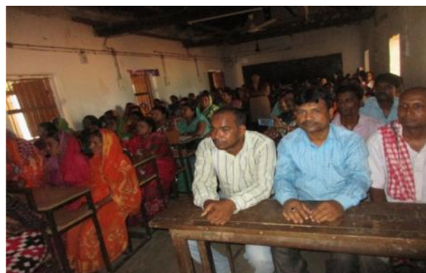
Legal Awareness Camp organised by the DLSA at Kangula Bentapur G.P.on 12.05.2017