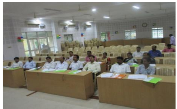
Training Programme for Remand Advocates at DRDA Conference Hall Angul