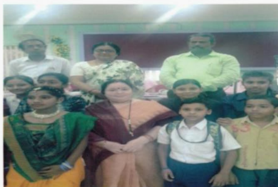
DIST. LEVEL SKIT COMPETITION, DLSA, JAJPUR DRDA CONFERENCE HALL, DT-05.07.2017

Skit competition was organised by the DLSA on 5.7.2017 involving the Members of 5 Student Legal Literacy Clubs (SLLCs). Further, 40 Legal Literacy Classes have also been taken in the 10 no.of Student Legal Literacy Clubs. Further, the DLSA has also organised a Debate Competition on the topic “Child Rights” among the members of the Student Legal Literacy Clubs of Jajpur District.