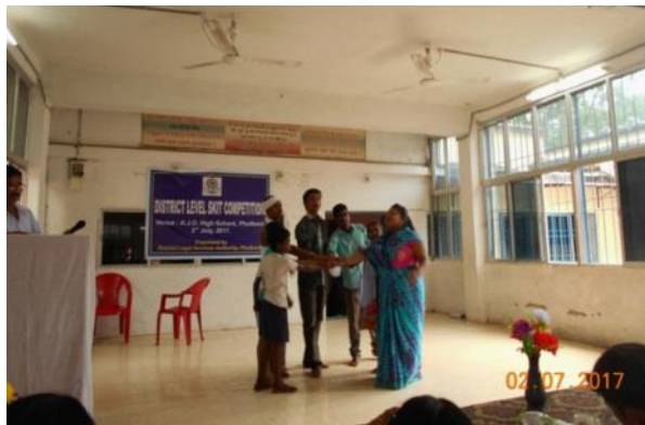
Skit Competition on 02.07.2017 in the conference hall of AJO High School, Phulbani