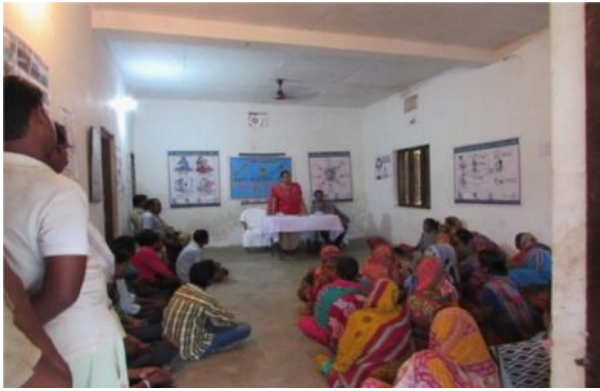
Awareness programme on Unorganised Labour