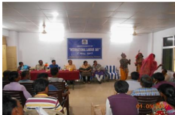
Observance International Labour Day on 1.5.2017 in the District Court premises.